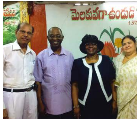
May 2014 Mission