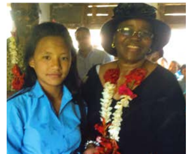
2014 Mission to Nepal