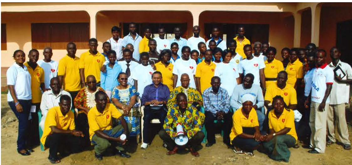
2012 Mission to Ghana