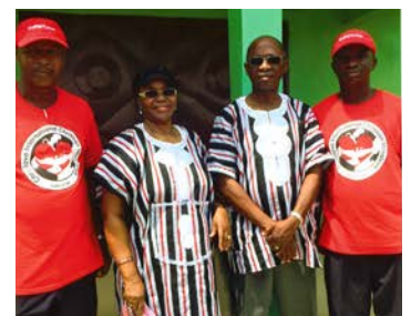
Mission to Liberia in 2018