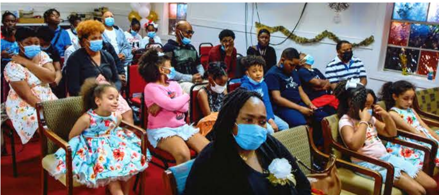
A Cross-section of the audience