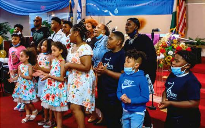
Spirit of Life Church Shreveport singing