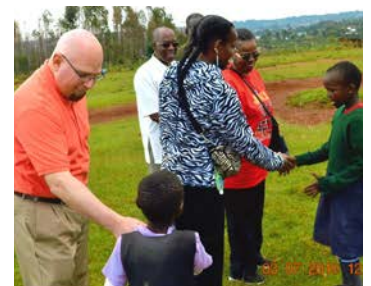
July 2019 Mission to Kenya