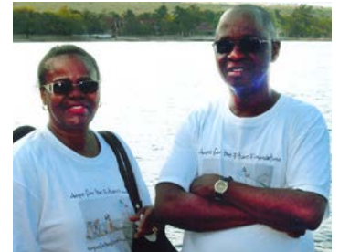
Mission to Haiti 2009