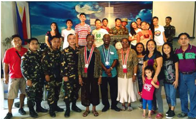
2016 Mission to the Philippines