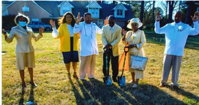
Ground Breaking Ceremony for our new Christlove Event Center