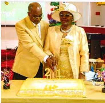
Cutting the 21st Anniversary Cake

CHRISTLOVE 21ST ANNIVERSARY MARCH 20TH, 2022