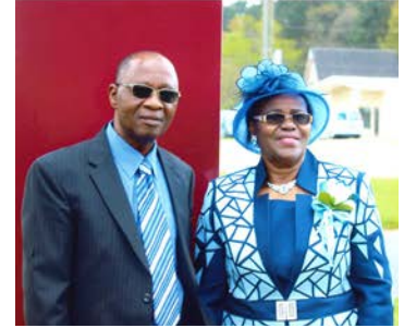
12th Church Anniversary 2013