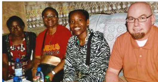
Mission to Kenya in 2019