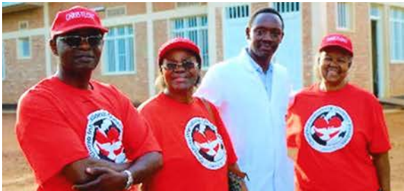
Mission to Rwanda 2017