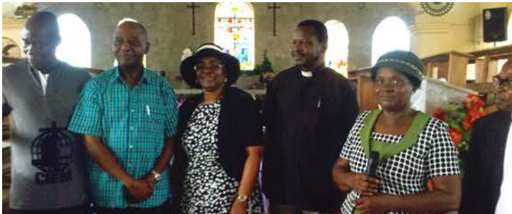
2015 Mission to Ado-Ekiti, Nigeria