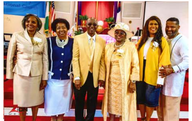
The Toguns with Guest Ministers