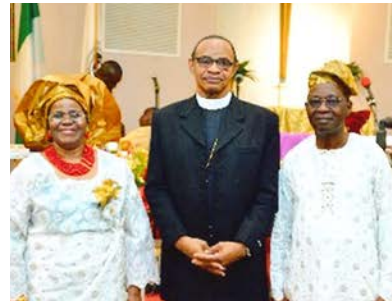
2016 Church Anniversary