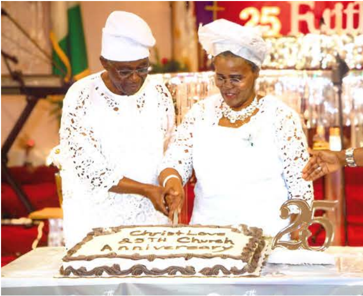
Cutting the anniversary cake