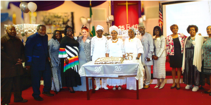
Ministers at the anniversary