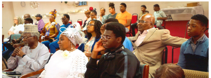
A cross section of the guests