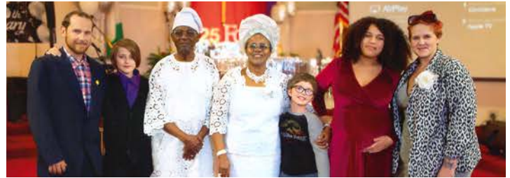
The Toguns and the Choat family