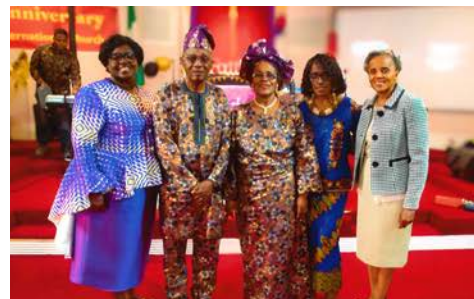
With guest ministers