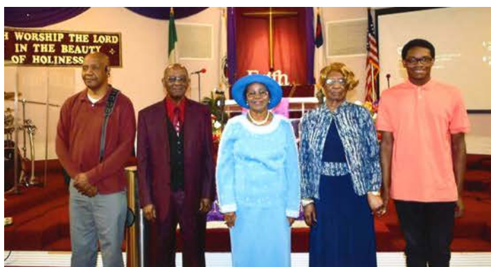
Group photo with the Toguns