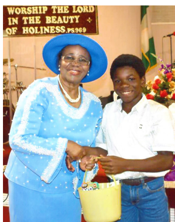
Easter gift presentation