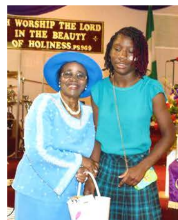
Presentation of Easter gift