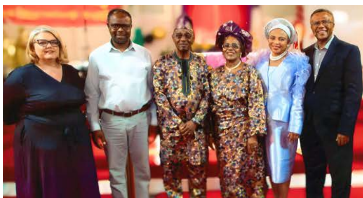
The Toguns with guests