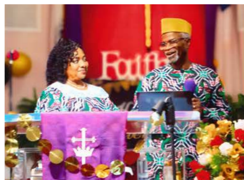
The Akanjis presenting Ewi in praise of God