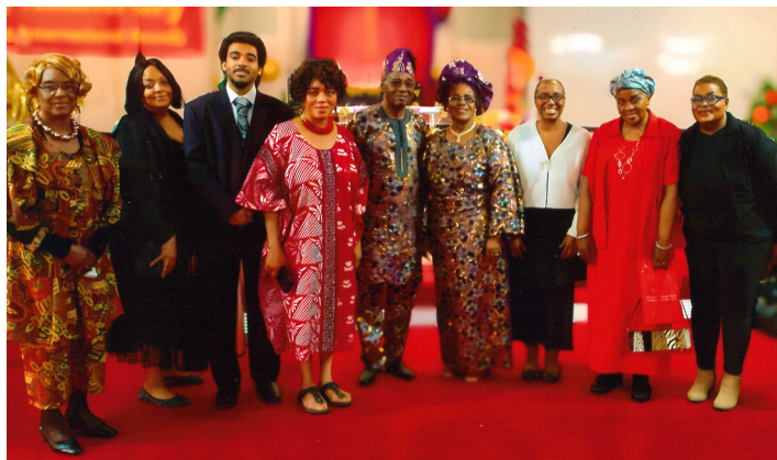
The Toguns with some members and guests