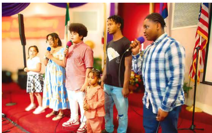
Youth from Spirit of Life Church